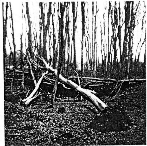
NORTHAW GREAT WOOD

THE STORM ENABLED FLORA AND FAUNA TO FLOURISH AND ENRICH THE DEVASTATED WOODLANDS. THE LEGACY HAS BEEN POSITIVE.